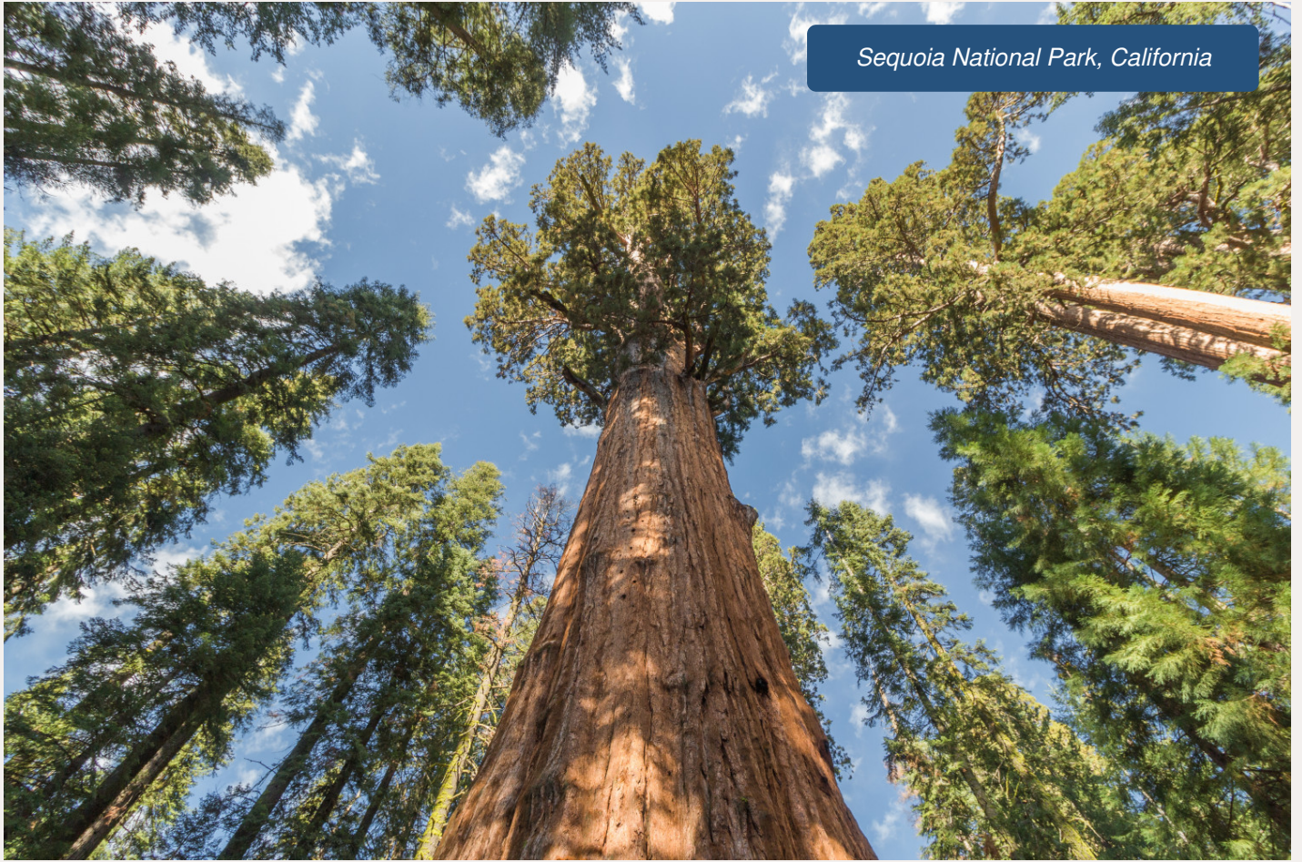
Sequoia National Park, California