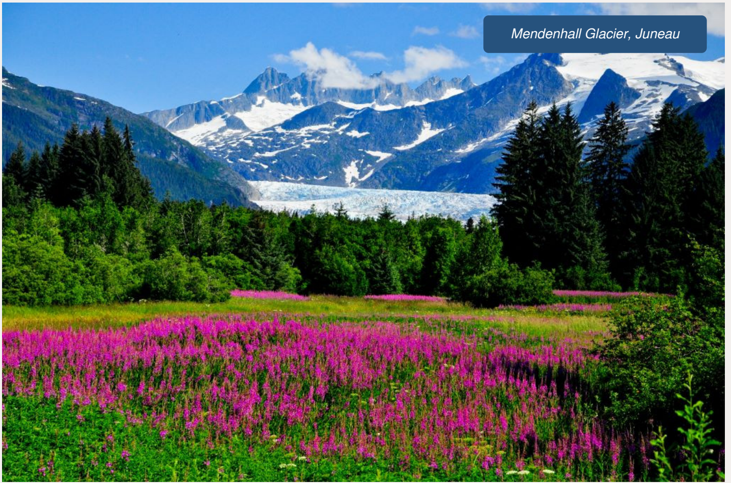
Mendenhall Glacier, Juneau