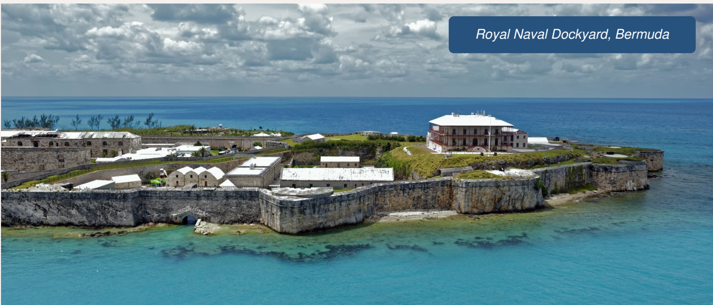
Royal Naval Dockyard, Bermuda