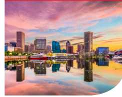
Solo Exclusive Thunderbirds Cruise October 6, 2018

Arrive at the "Switzerland of Pennsylvania" and be surrounded by high-rising cliffs and be entranced by the mountain scenery while aboard the Lehigh Valley Scenic Gorge Railway . Enjoy a lovely lunch at the Broadway Grille, followed by a tour of the Asa Packer Mansion. Spend time browsing the many antique and specialty boutique shops, in this quaint historic town of Jim Thorpe!