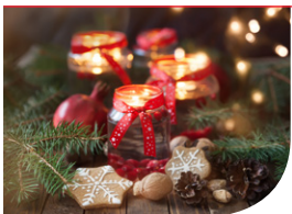
Solo Exclusive Homes for the Holidays December 4, 2018

Begin your day celebrating the holiday season with guided tours of Johns Hopkins University's magnificent historic house museums, decorated in period style; Mount Clare, Garrett Jacobs Mansion, Homewood Museum and the Evergreen Museum & Library. Each property has unique characteristics, charm and architecture. Guided tours at each location will provide not only an opportunity to enjoy the holiday décor, but also the history, traditions and opulence of a bygone era. A buffet lunch is included while touring the Garrett Jacobs Mansion.