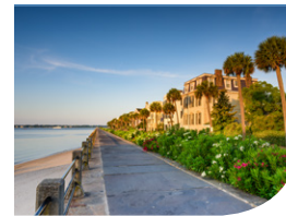
Solo Friendly Southeast Coast & Bahamas Cruise January 24 - February 2, 2019

PRICE PER PERSON: Single ..... $6,369 Double ..... $5,729