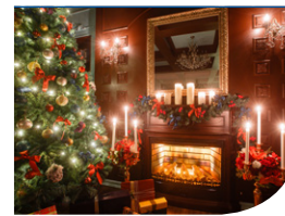
Solo Friendly Traditional & Tacky Lights Tour December 15 - 17, 2018

A perfect trip for an extended weekend getaway to put you in the holiday spirit! After enjoying a dinner at Capital Ale House, one of Richmond's favorite dining spots, you will head outside to board the trolley for the Tacky lights tour. Richmond has received the dubious distinction of having some of the best tacky holiday lights in America. You will get to see some of the hottest art in town at a glass studio where you'll watch a live demonstration of how molten glass becomes a work of art. You'll see how traditional glass Christmas ornaments are made and maybe get to lend a hand. Before heading home enjoy a tour of Thomas Jefferson's boyhood home which will be decorated for the holidays.