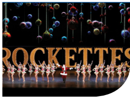
Solo Friendly Radio City Christmas Spectacular & More December 6, 2018

PRICE PER PERSON: Single ..... $1,819 Double ..... $1,429