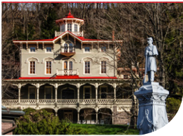
Solo Exclusive Historic Jim Thorpe September 22, 2018

These trips are only available to Solo Travelers Club members! Meet like-minded travelers who want to share the fun, peace of mind, and convenience of group travel.