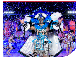
Solo Exclusive Celebrate New Year's with the Mummies December 31, 2018 - January 1, 2019

Begin your day celebrating the holiday season with guided tours of Johns Hopkins University's magnificent historic house museums, decorated in period style; Mount Clare, Garrett Jacobs Mansion, Homewood Museum and the Evergreen Museum & Library. Each property has unique characteristics, charm and architecture. Guided tours at each location will provide not only an opportunity to enjoy the holiday décor, but also the history, traditions and opulence of a bygone era. A buffet lunch is included while touring the Garrett Jacobs Mansion.