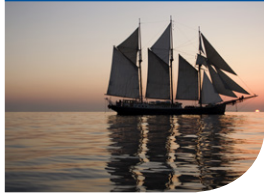
Solo Friendly The Great Chesapeake Bay Schooner Race October 11, 2018

These trips, while not exclusive to Solo Travelers Club Members, offer a great opportunity to travel with friendly folks at a great value. Solo Club Members benefit from the pre-negotiated discount of the applicable single supplement fee, as well as the convenience and security of group travel.