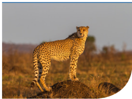
Solo Friendly Spectacular South Africa Culture & Nature in Harmony hosted by RJ Harris, WHP580 January 10 - 23, 2019

PRICE PER PERSON: Single ..... $769 Double ..... $629